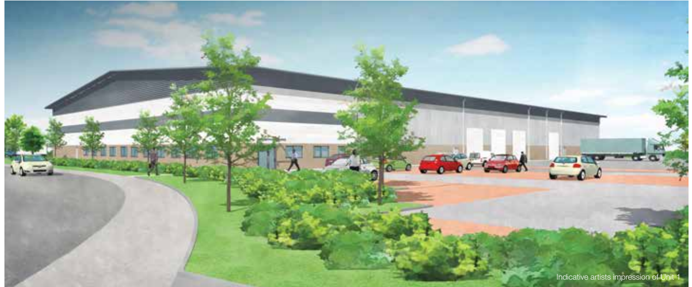
Indicative artists impression of Unit 1